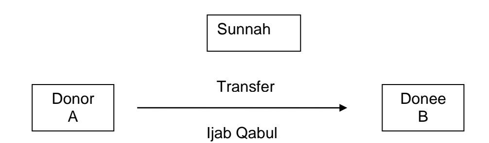
Diagram A: Structure of Hibah Trust Stage 1

In this stage, hibah is a pronouncement or an act which means giving and receiving of hibah either verbally or in any manner which carries the meaning of giving away of property ownership without repayment. If Donor A, a registered person transfers assets worth RM5,000 to Donee B, it is a taxable supply and A has to account for GST. However, if A, an individual donates the assets worth RM5, 000 to Donee B he is not liable to charge GST since he is not registered. Please refer to Diagram B as follows: